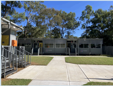
Brand new comfortable facilities